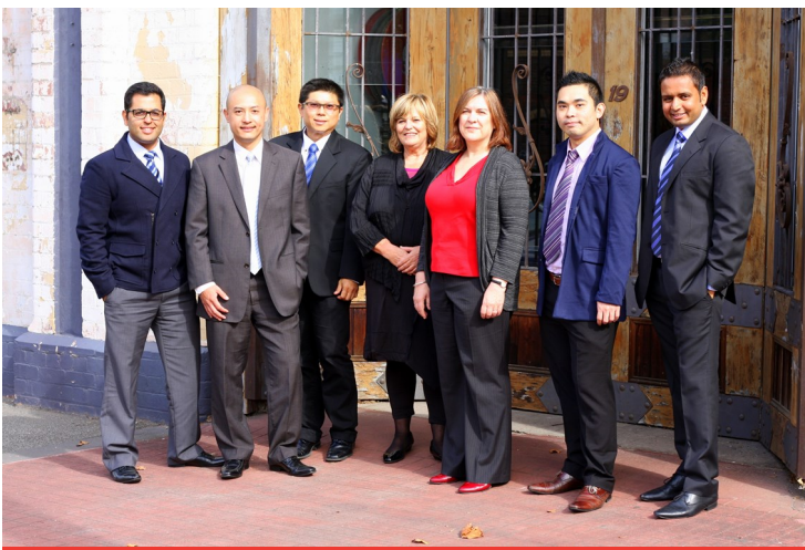
Communicat ERP Support Team